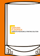
Stand Up Pouch