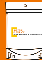
Standy Zipper Pouch