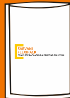
3 Side Sealed Pouch