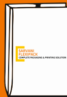
Center Sealed Gusseted Pouch